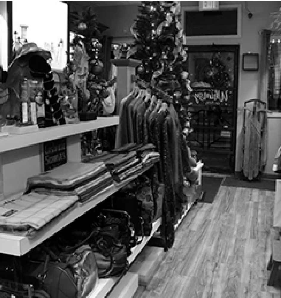
Whimsy on Fifth.