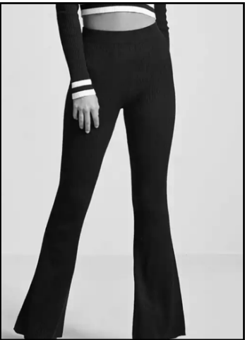
Bottoms – Forever21.com, Flared Ribbed Leggings, $19.90

2. The next one is slightly less casual, but still comfortable nonetheless – maybe your cute outfit will distract your family from asking you a million questions about school? Anyway, plaid is always holiday appropriate and sweaters just make everything better. Pair this outfit with a pair of black booties and you're good to go!