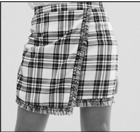
Skirt – Asos.com, Missguided Check Frayed Hem Wrap Mini Skirt, $40.00

3. The last one is very dressy and would definitely be suitable for a fancy holiday party, dinner, or sitting at home in your bed (hey, I'm not here to judge!) Wherever you wear this, you'll catch everyone's attention and for sure be the star of the night.