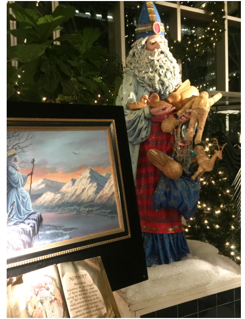
Spirits of Giving from Around the World.