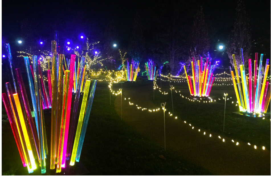
Phipps Conservatory Winter Flower Show.