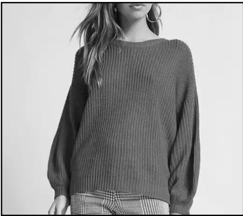
Top – Forever21.com, Ribbed Lantern-Sleeve Sweater, $28.00

1. This one's for the girls who like to be comfortable but still want to look cute. We all know how it goes during the holiday season; you go to Grandma's for dinner, eat way too much, and end up sitting at the table with your pants unbuttoned by the end of the first course. Two words for you: STRETCH PANTS. Guaranteed, these will be your best friend this season – bonus points for cuteness.