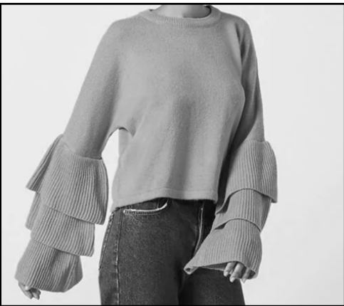
Top – Forever21.com, Tiered-Sleeve Sweater Knit Top, $22.90

2. The next one is slightly less casual, but still comfortable nonetheless – maybe your cute outfit will distract your family from asking you a million questions about school? Anyway, plaid is always holiday appropriate and sweaters just make everything better. Pair this outfit with a pair of black booties and you're good to go!