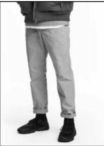
Pants- hm.com, Cotton Twill Chinos, $34.99