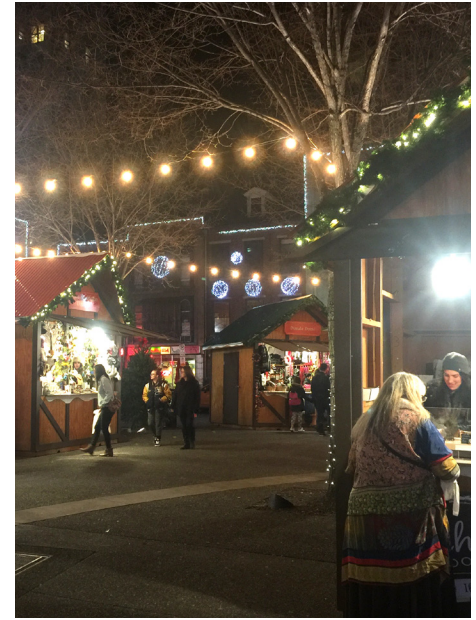
Market Square Holiday Market.