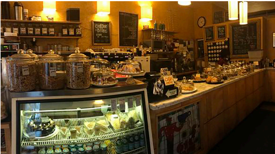
61C front counter.

noisseur, the 61C Cafe is a place that welcomes everyone. The cash only policy evokes a nostalgia that you can appreciate and makes you feel like you are taking a step back in time. The