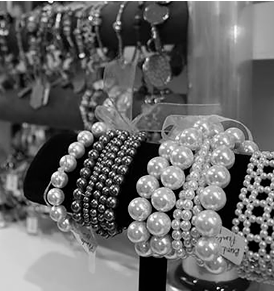
Whimsy on Fifth.

Between Nov. 20 and Dec. 20, Whimsy on Fifth is running a promotion for customers. For every $20 spent in the store, customers are given one entry to be drawn to win a signed Sidney Crosby 2017 Winter Classic Jersey!