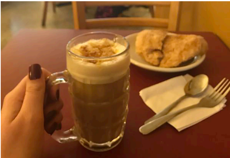
Chai Tea Latte and Apple Foldover.

Whether you're looking for a new spot to study or you're a coffee con-