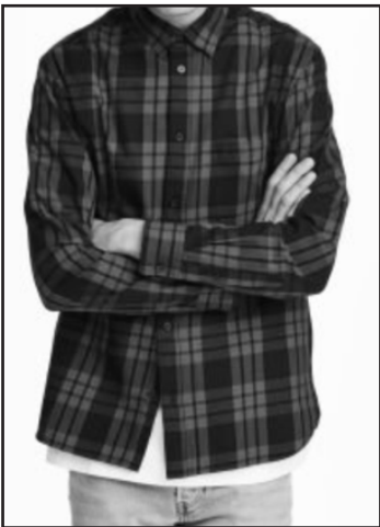
Shirt- hm.com, Cotton Shirt Regular Fit, $24.99

4. Men can get away with wearing almost anything, but for those of you who like to be a little bit more fashionable, here's some inspo! You can never go wrong with a pair of fitted khakis and a button-down shirt. Add some flannel or denim & you'll be just as fashionable as the ladies!