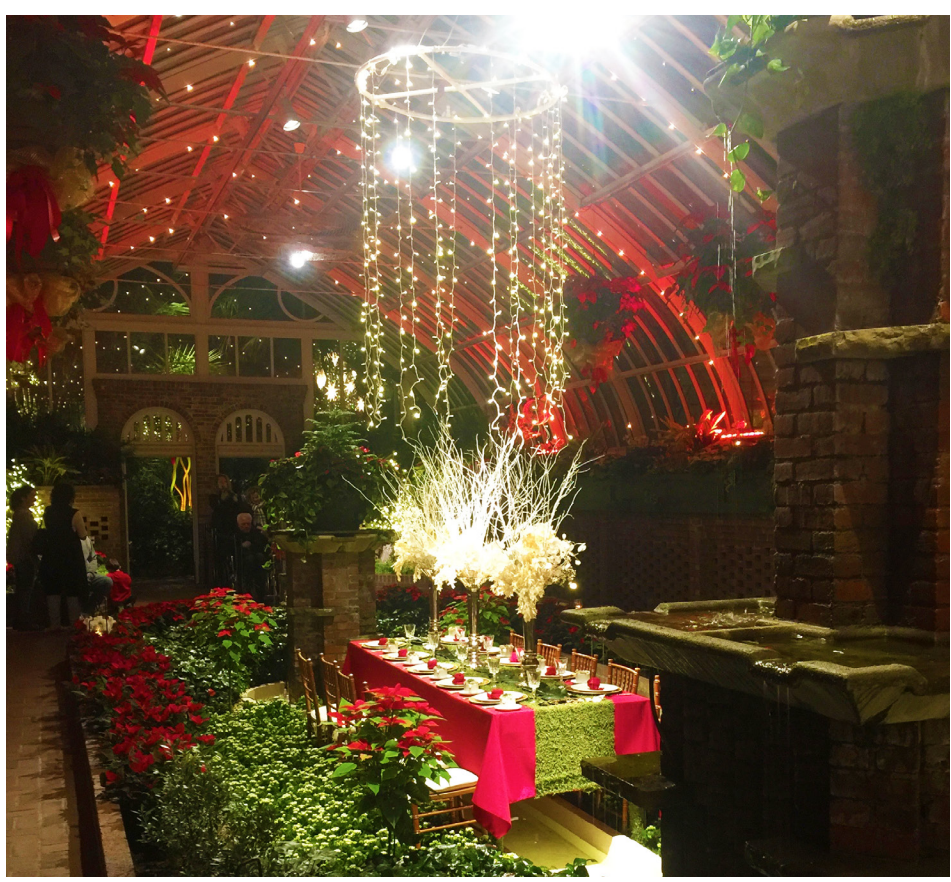
Phipps Conservatory Winter Flower Show.