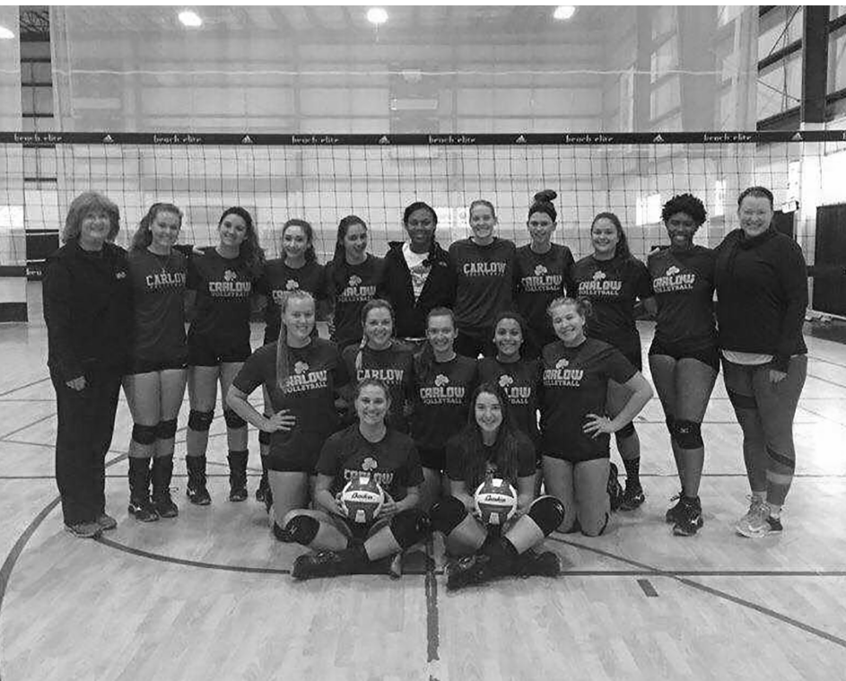
Carlow Celtic’s Women’s Volleyball Team.